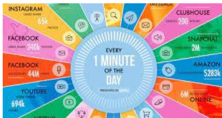
Figure N° 4 One minute of Internet

This annual infographic from Domo captures how much activity occurs in a given minute and how much data users generate. To put it mildly, there is a lot.