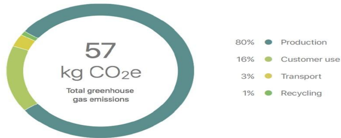
Greenhouse Gas Emissions for iPhone 8—64GB model

Environmental Report | iPhone 8 | September 2017